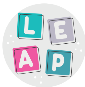
LEARN, EQUIP & PARENT PROGRAM